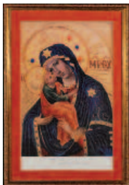
1988-89 Our Lady of Pochoiv