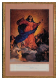
1990-91 Our Lady of the Assumption