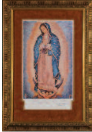
2000-01 Our Lady of Guadalupe