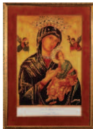
1984-85 Our Lady of Perpetual Help