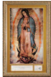
2011-13 Our Lady of Guadalupe