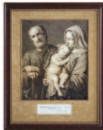
2015-16 Holy Family