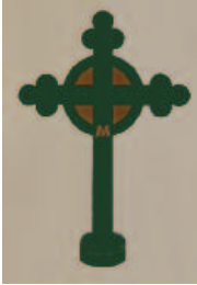
1999-2000 Millennium Cross