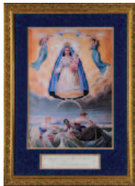
2007-08 Our Lady of Charity