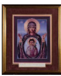
1997-98 Our Lady of the New Advent