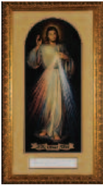
2003-04 Divine Mercy