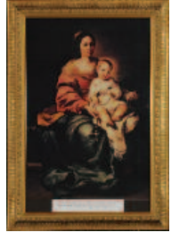
2002-03 Our Lady of the Rosary