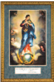
2013-14 Immaculate Conception