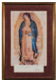
1995-96 Our Lady of Guadalupe