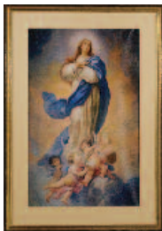
1981-82 Immaculate Conception