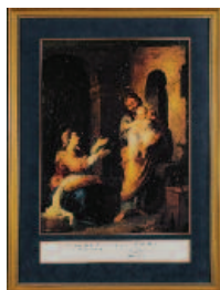
1993-94 Holy Family